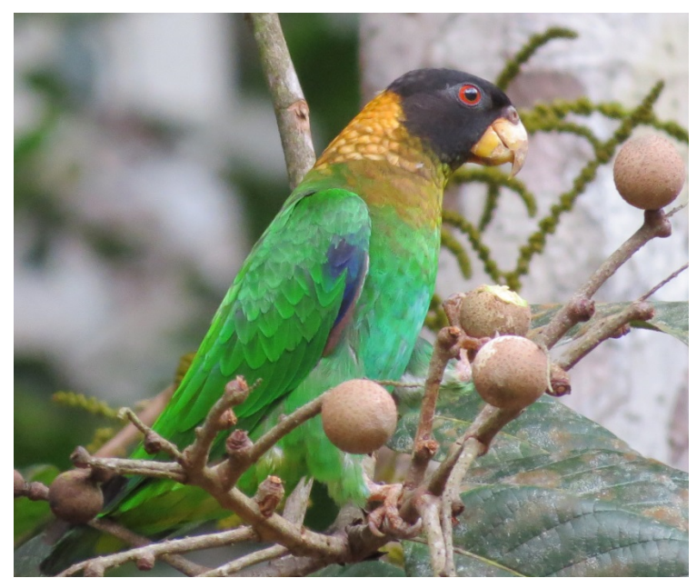
and Caica Parrot feeding on fruits

This morning, departing River Lodge after an early breakfast, we'll bird on the road along the way to Atta Lodge. Some forest birds are very elusive and hard to see, including Rufous-winged Ground-Cuckoo, Guianan Shiffornis, Black Curassow, Grey-winged Trumpeter, Black-throated Antshrike, Chestnut-rumped and Longtailed Woodcreepers, Brownbellied, Rufous-bellied and Long-winged Antwrens, Fasciated Antshrike, Whitethroated Toucan, Golden-collared Woodpecker.