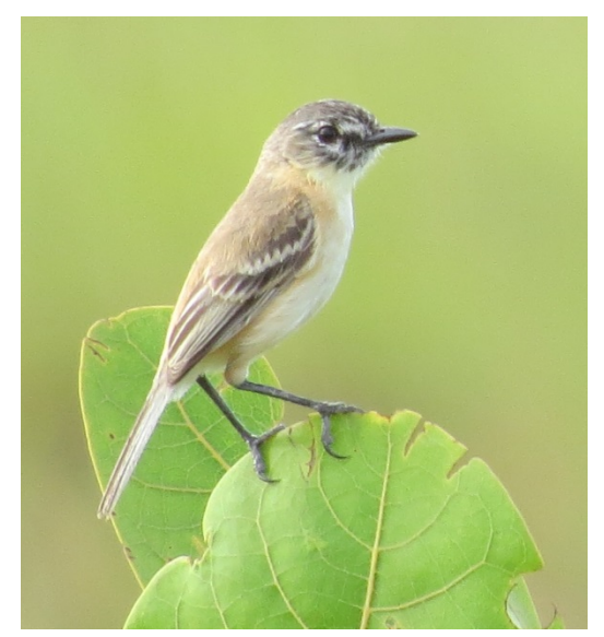
Bearded Tachuri at Caiman house Lodge - Male

remarkable Giant Anteater in habitat that is perfect for it and Savanna Fox.