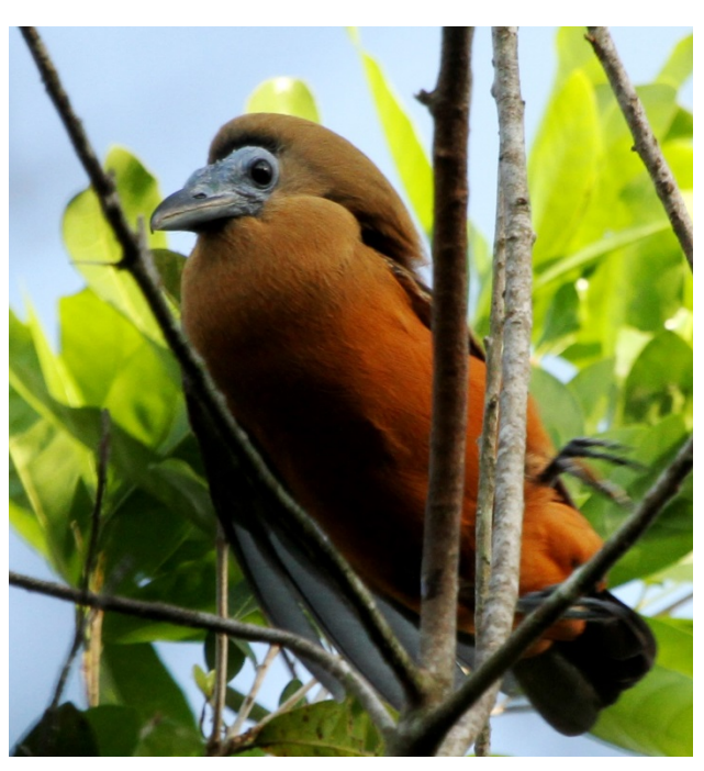
forest Capuchinbird in full Leking display

be surprised if you are awakened by the dawn calls of Spectacled Owl or Slaty-backed Forest-Falcon. Afterward, we will bird the trails around the lodge and visit a nearby Capuchinbird lek. To see and hear these strange birds displaying truly is а unique experience. We have had the pleasure of this experience previous trips. We'll be up early birding the trails and then taking a boat trip on the Essequibo River. Turtle Mountain will be our objective where we will explore the main trail, visit Turtle Pond, and climb to an elevation of about 900 feet for a spectacular view of the canopy below. The trail to Turtle