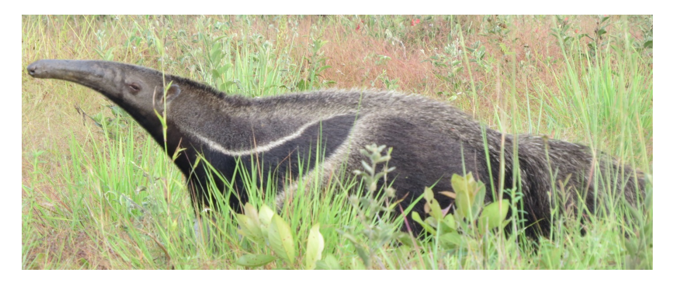
Giant Anteater feeding during the early morning period, this animal is seen regularly on our tours

species of monkeys and even the occasional Emerald Tree Boa and Amazonian Tree Boa as they come out to feed just as it gets dark. Our sunset expedition wraps up with a delicious and hearty dinner back at the Caiman House Lodge.