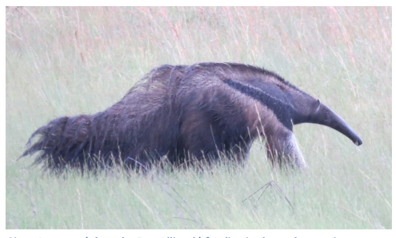
Yellow-Finch, Giant Anteater feeding in the early morning at pit, White- Kwatata Village

Bobwhite, Green-rumped Parrotlet, Yellow-hooded Blackbird, the colorful Orange-backed Troupial, and the agile Aplomado Falcon. We may even encounter a Giant Anteater if we are lucky. In the afternoon, we will bird the local forest and some ponds where we'll hope to see Sunbittern, Azure Gallinule, White-faced Whistling-Duck, White-headed Marsh Tyrant, White-browed Antbird, Buff-breasted Wren, Pale-tipped Inezia, Blue-backed Manakin, Striped Woodcreeper and maybe Undulated Tinamou. An evening excursion to the open grasslands as the sun sets should see the end of a magical day with White-tailed Nightjar, Spot-tailed Nightjar, Nacunda, Least and Lesser Nighthawks.