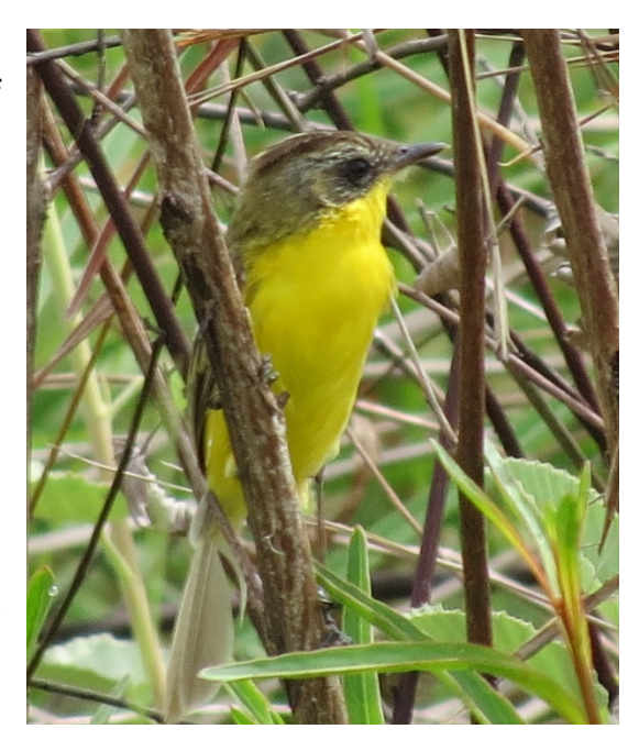
Crested Doradito Caiman House Lodge

This morning, we will start with a cup of Brazilian-style coffee before heading out into the Rupununi Savannah by 4x4. As we move across the savannah, we'll scan the vast wetland areas for the soughtafter Bearded Tachuri plus Sharp-tailed Ibis, Yellowish Pipit, Pinnated Bittern, Brazilian Teal, White-tailed Goldenthroat, Vermilion Flycatcher, Bicolored Wren, Double-striped Thick-knee, Burrowing Owl and Maguari Stork. We'll also check an area where the rare and localized Crested Doradito was recently discovered. This is also our best chance to see the