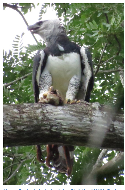
Howler Monkey, brought in to feed the chick.

We'll have lunch back at the lodge. Then in the late afternoon, we'll do a final walk on the forest trails around the eco-lodge where there are excellent opportunities birding. Swarms of army ants may be encountered patrolling the forest floor in search of prey. Species that can be found include Capuchinbird, Red-legged Harpy Eagle With Red here Black-spotted Barbet, Green Tinamou, Aracari, Black-necked Aracari, Guianan