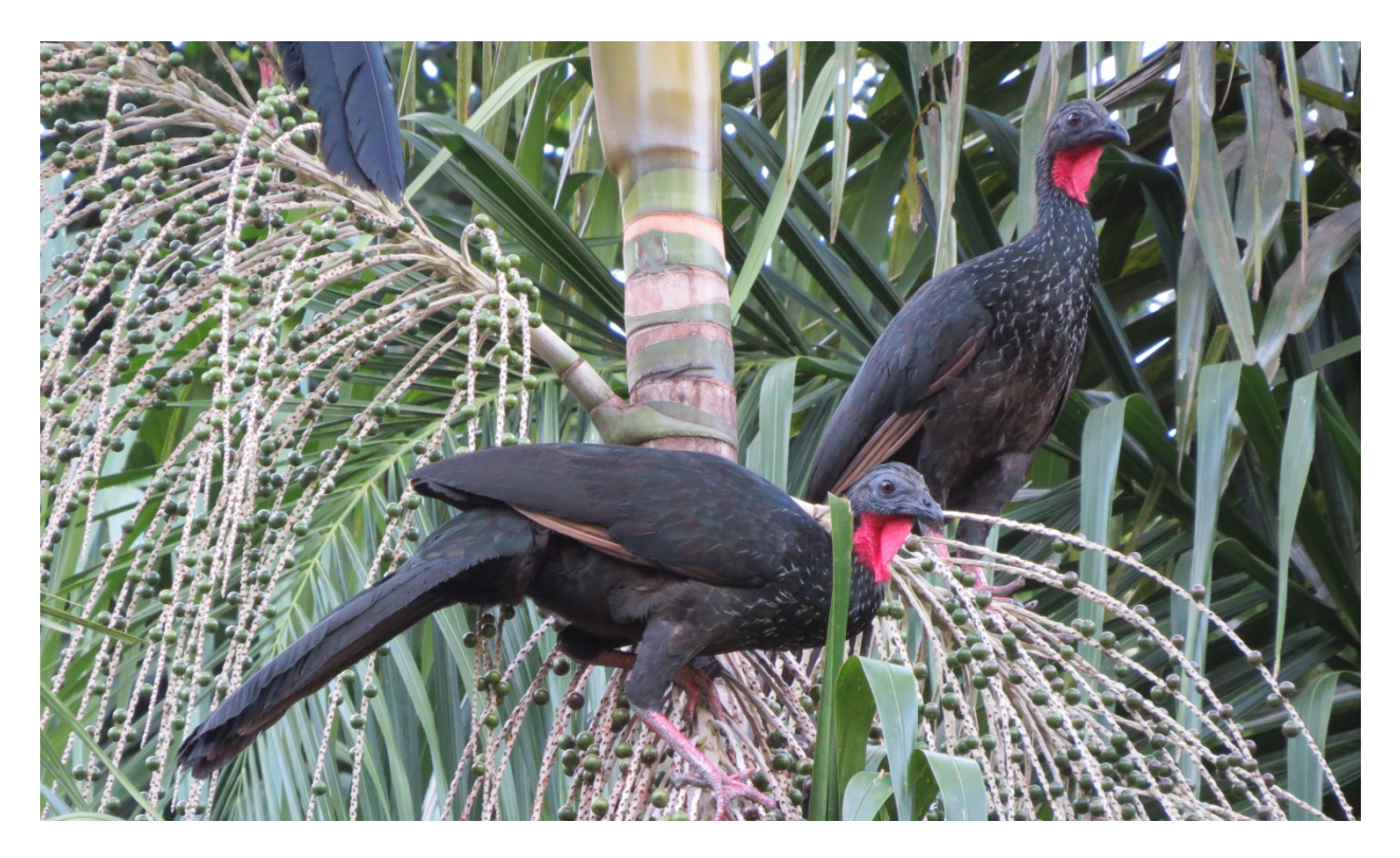
Spix's Guan feeding on Manicole Palm fruits

Today, it will be an early start in 4x4 vehicles for a 30-minute drive to the lek of the Guianan Cock-of-the-Rock where we'll have our second chance to see this beautiful bird. Hopefully having seen the bird well, we will continue to Surama Eco-Lodge, birding on the way. We plan to arrive at the lodge for lunch and a well-deserved cold beer or cold drink of your choice. Birds in the forest on our return walk may include the shy Rufous-winged Ground-Cuckoo and Rufous-throated Antbird. After lunch, we'll bird along the forest edges and visit nearby roosts of a Great Potoo. We may find Grassland Sparrow, Wedge-tailed Grass-Finch, Forest Elaenia, White-throated Toucan, and Fork-tailed Palm-Swift Finch's Euphonia and time permitting we will try for the Ocellated Crake. At dusk, White-tailed Nightjar, Least Nighthawk, Lesser Nighthawk, Tropical and Tawny-bellied Screech-Owls will be quite likely.